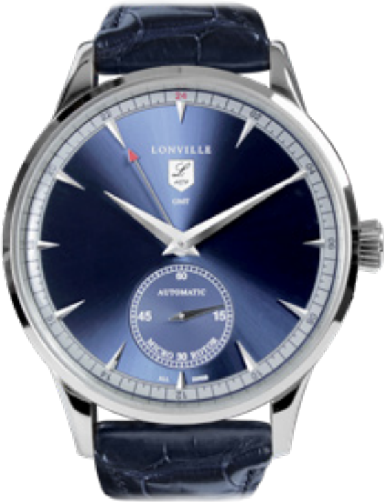
LONVILLE VIRAGE '59 BLUE GMT.