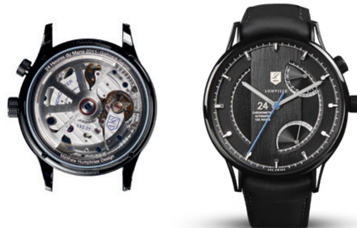
LONVILLE G24 'SUPERLEGGERA'. SUPER LIGHTWEIGHT TITANIUM. DRILLED LUGS. RACY.

Limited to just 24 numbered pieces, with the owner's name engraved under the sapphire case back. LV2 automatic, COSC certified movement with 120 hours of power reserve. Côtes de Genève finished, blued screws and blue engraving. Multilayer dial with hand finished surfaces. Power reserve indicator and retrograde date. Titanium, hand polished and brushed case and closure. Each lug is drilled by hand to create the ultimate lightweight feeling. PVD black. All Swiss, of course.