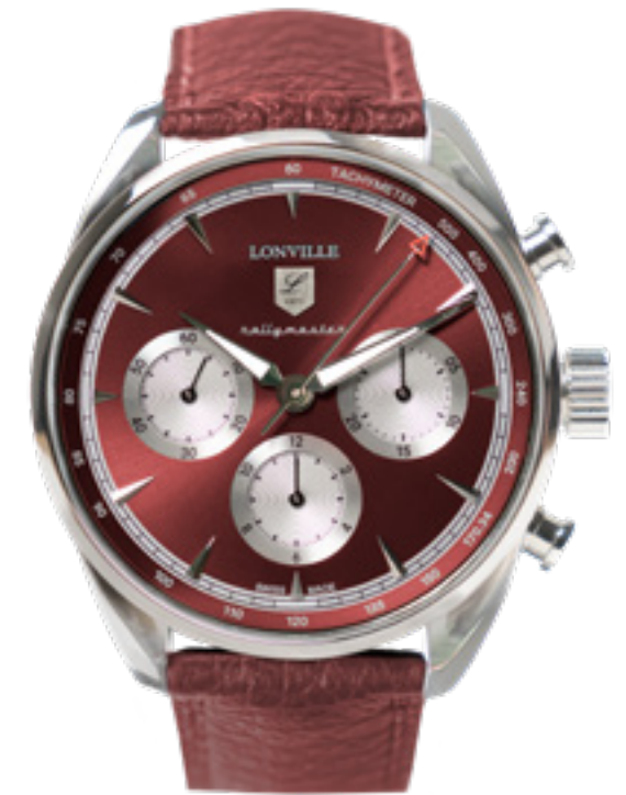
Corso Red 88 pieces